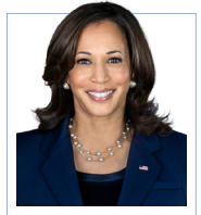
D KAMALA HARRIS