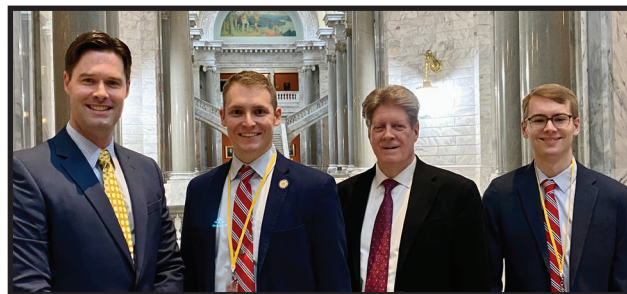
TFF's policy team on the opening day of the 2025 General Assembly.

Of special note are executive orders signed to close